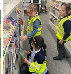
FIG CLASS MINIBEASTS

Fig Class have been practising their cutting skills this week whilst learning about mini-beasts. Look at their great leaves and insects.