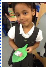
Fig Class have been practising their cutting skills this week whilst learning about mini-beasts. Look at their great leaves and insects.