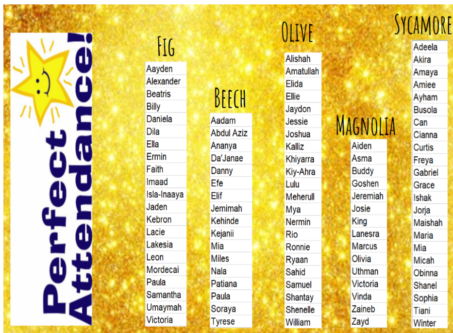
Fig Class Learning

Fig Class have been working hard this week! They are enjoying the story of The Very Hungry Caterpillar and made these brilliant handprint paintings. They have also been working well together on