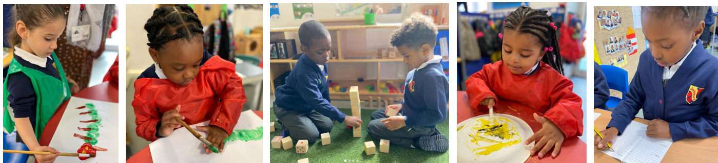
Fig Class have been working hard this week! They are enjoying the story of The Very Hungry Caterpillar and made these brilliant handprint paintings. They have also been working well together on